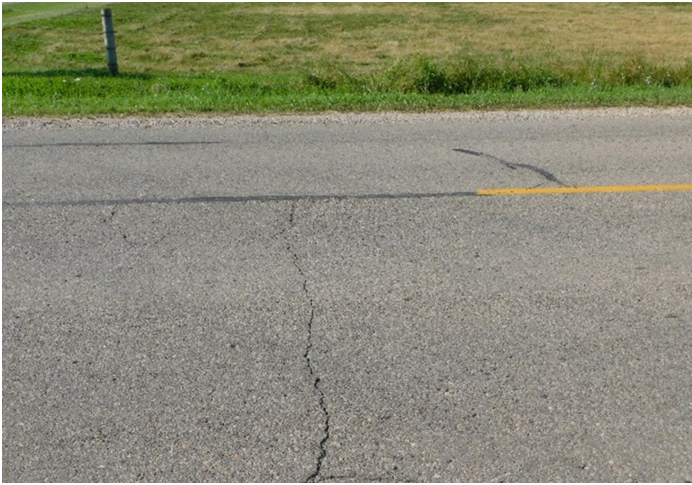
Pre-construction condition of Arthur St E at 32nd Ave