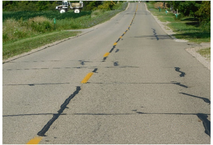
Pre-construction condition of Arthur St E between 48th and 40th Ave