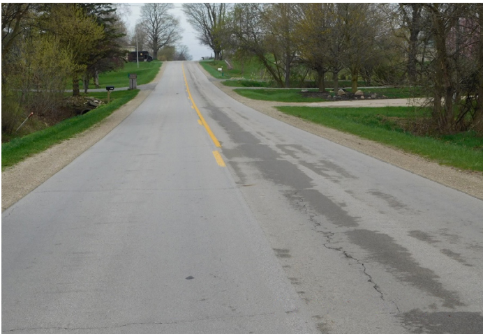
Aged roadway 31 months after application