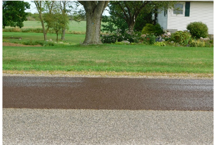
Application completed on one half of the roadway