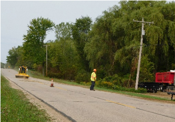
Final cleaning of the surface prior to application